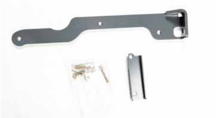
Figure 1 Arm Link, Hardware, & Height Selector Tube