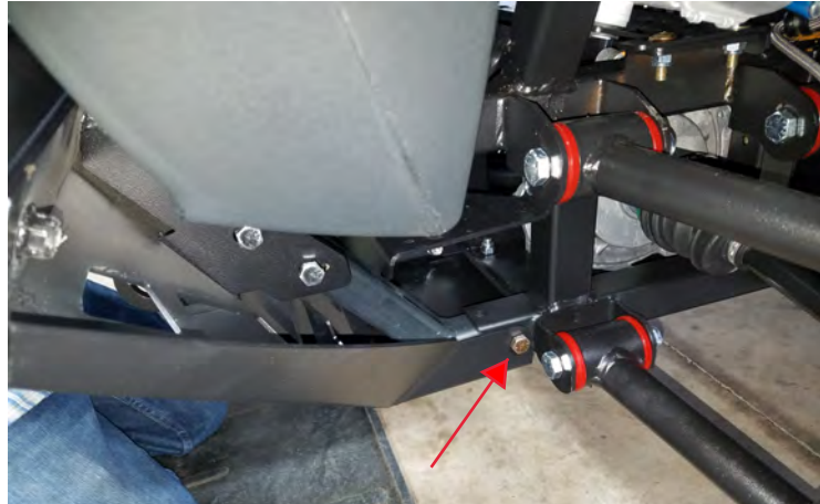
Skid Plate Mounting Bolt Location

Step 11: Mount the bumper assembly by first securing the skid plate to the frame at the base of the lower hitch bracket. Slide the skid plate onto the tow loop brackets so that they protrude in front of the skid plate. Use the 2 bolts that were removed in Step 9 to secure the skid plate.