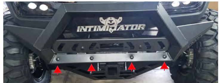
Skid plate to Bumper Mounting Bolts

Step 6: Remove the stock bumper by removing the 6 carriage bolts. There are 3 on each side of the bumper.