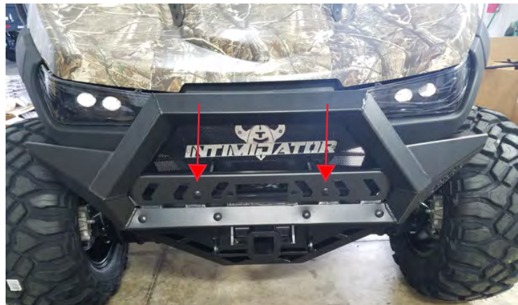
Bumper Mounting Hardware Location

Step 12: Align the bumper with its corresponding mounting holes and secure it with 2 carriage bolts and their corresponding nuts. Tighten all hardware.