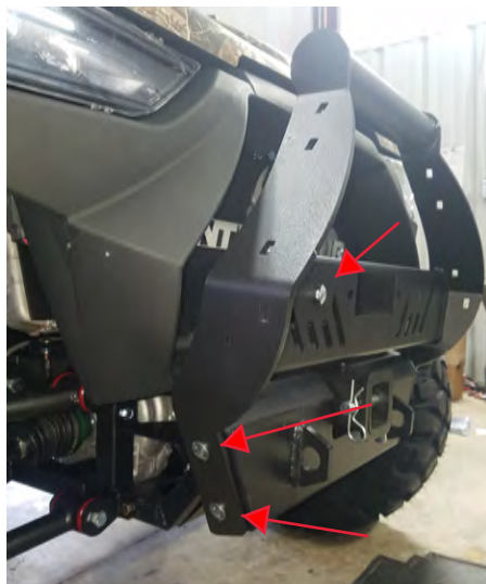
Stock Bumper Mounting Hardware

Step 6: Remove the stock bumper by removing the 6 carriage bolts. There are 3 on each side of the bumper.