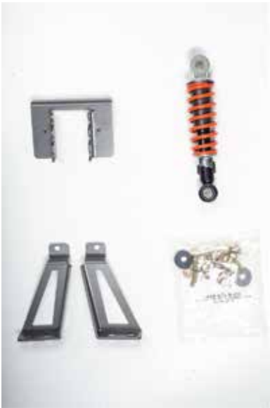
Figure 2 Mower Bracket, Shock, Mounting Brackets, & Attachment Parts