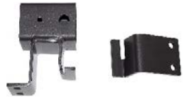
Two Part Receiver Clamp