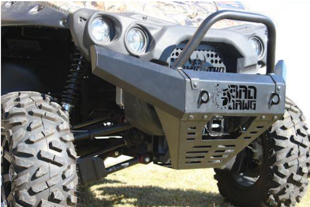
Finished bumper shown with optional Bull Bar