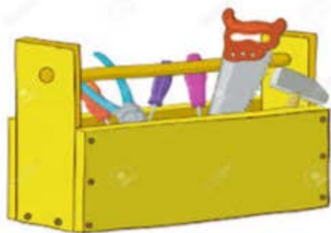
Tool Time Master Woodworker Owen Carpenter