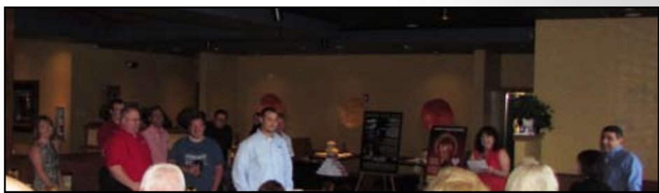
First Friday Breakfast hosted by The Food Bank of North Central Arkansas on July 10. Bridge Bash and Stand Up 4 Hope will be on Saturday, September 26, 2016 at the Cotter Springs Bridge.

Business After Hours was hosted by Ultimate Buick/GMC on June 18 where they gave away several gift certificates of automotive service and one ipad mini! Business After Hours is a great Chamber networking event usually on the 3rd Thursday of each month.