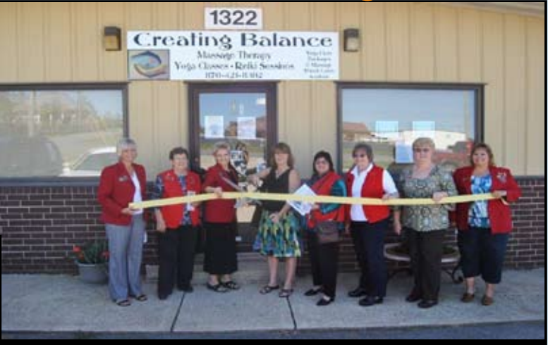
The Chamber Ambassadors helped welcome two new members in September.... Creating Balance and SHINE Hair Color Headquarters