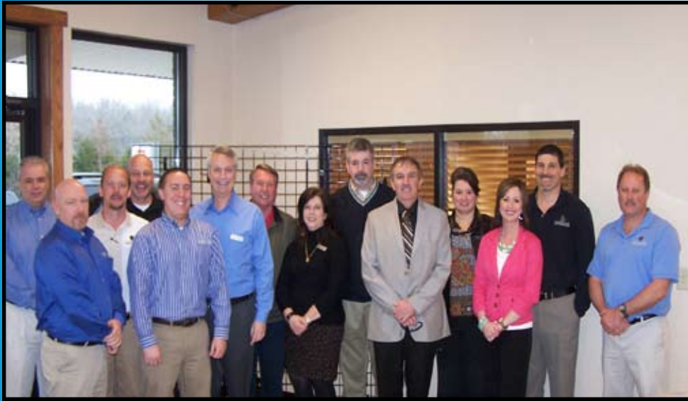
Business After Hours was hosted by Ultimate Auto Group in March.