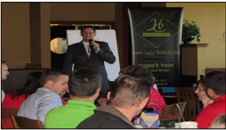
First Friday Breakfast was hosted by Hunter Capital Wealth May 2, 2014