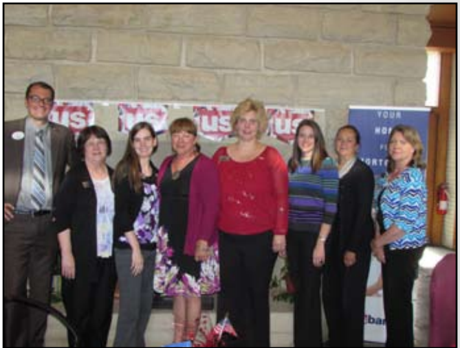
Business After Hours hosted by US Bank on May 15. Thank you for your support!