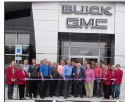
ULTIMATE AUTO BUICK/GMC RIBBON CUTTING APRIL 24