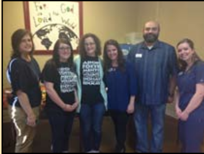
BUSINESS AFTER HOURS hosted by THE CALL OF BAXTER COUNTY APRIL 16th