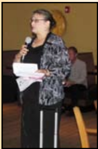
FIRST FRIDAY hosted by SERENITY, INC MAY 1