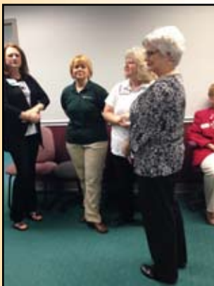
GOOD MORNING MOUNTAIN HOME hosted by CENTURYLINK MAY 5