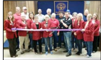
TL HOMEBUILDERS 25TH ANNIVERSARY RIBBON CUTTING APRIL 10