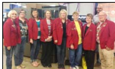
CHAMBER AMBASSADORS Just a few of the folks who give selflessly to the Chamber!!