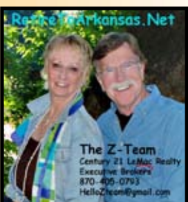
The Z-Team Century 21 LaMac Realty Executive Brokers 870-405-0793 HelloZTeam@gmail.com